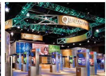
Intelligent Lighting Systems and Custom-Designed Truss