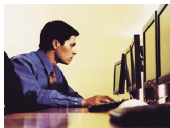
Computer Equipment and Peripherals